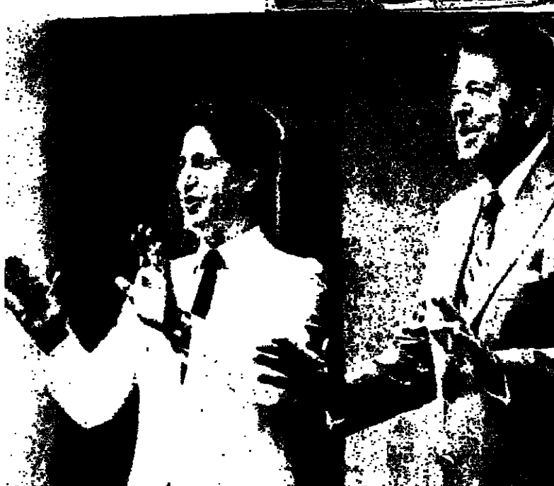
U.S. President Ronald Reagan, right, and Lebanese President Amin Jemayel gesture in unison at the White House during their Friday morning meeting.